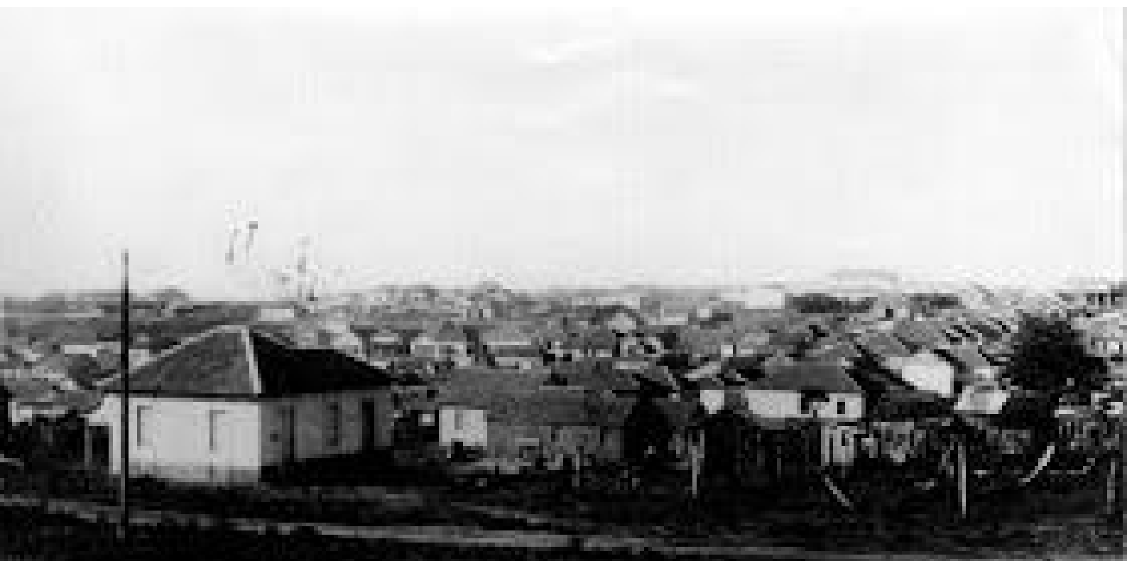
22 Panorama. Manila. 6-929