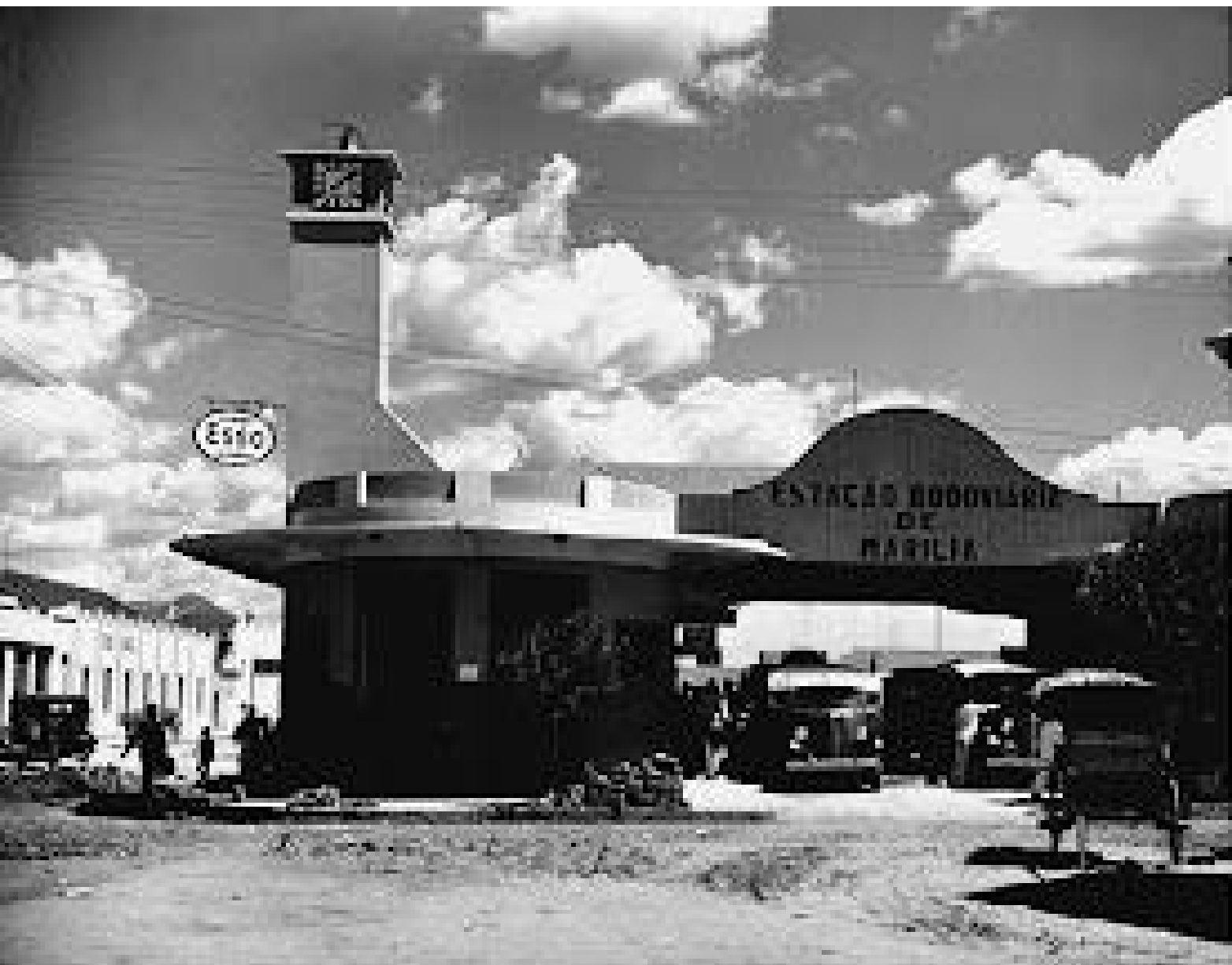
Uma vista da Estacion Rodoviaria de Curitiba, mostrando o relógio de torre e o estacionamento.