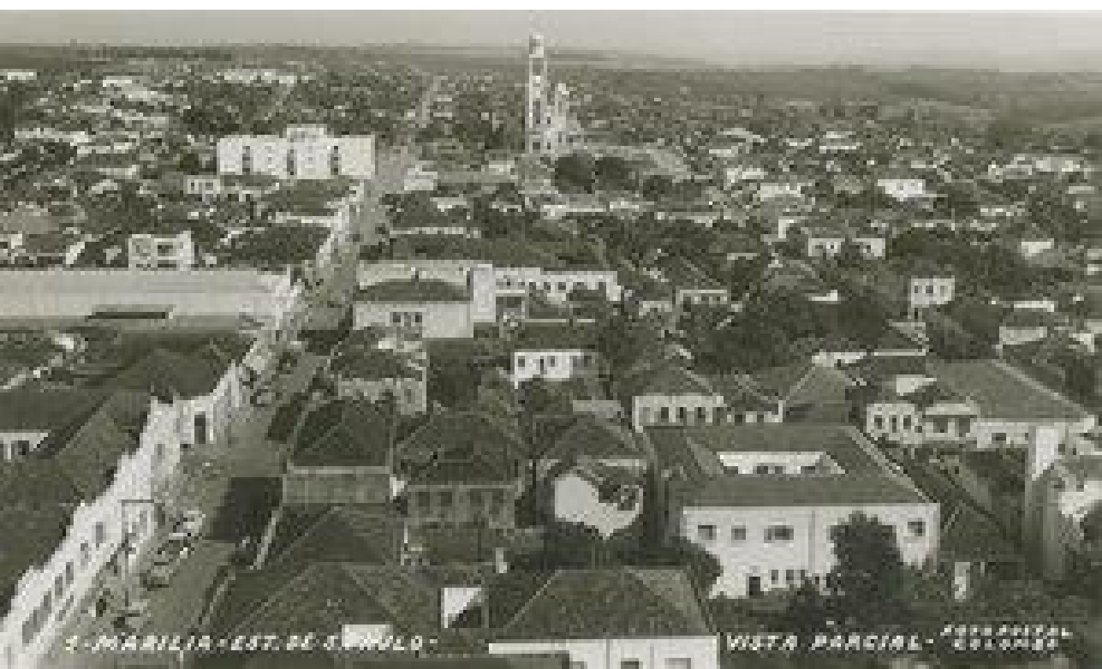
1 - MARILIA - EST. DE S. PAULO -