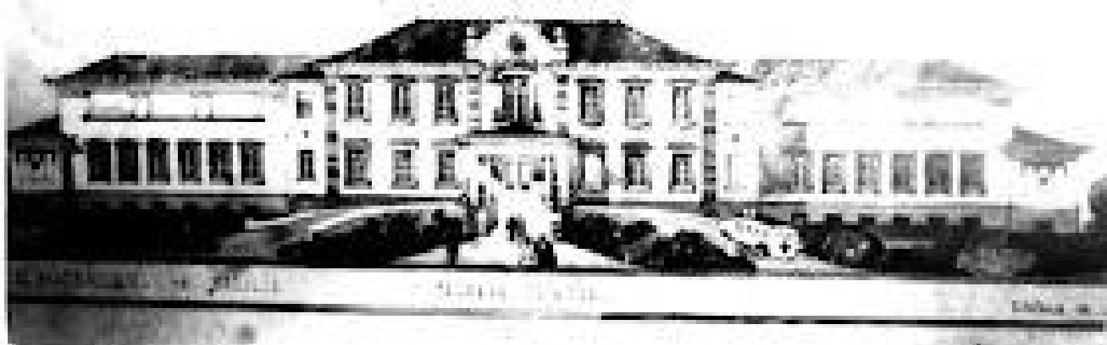
THE UNIVERSITY OF MICHIGAN LIBRARY BUILDING