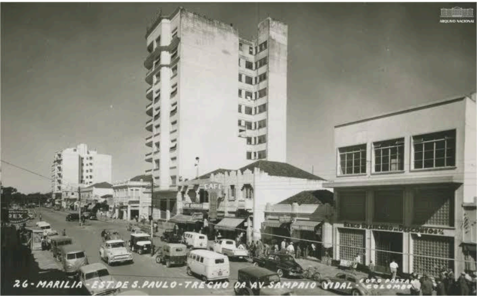
26 - MARILIA - EST. DE S. PAULO - TRECHO DA AV. SAMPAIO VIDAL