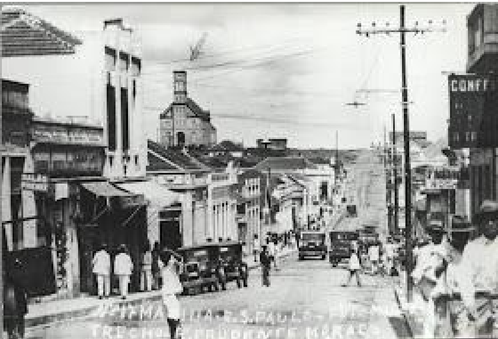
TRENCHON, N. J. - ST. PAUL'S CHURCH AND THE MARAS